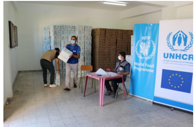
The joint WFP and UNHCR distribution of monthly food parcels continues, this time at the city of Misrata, 200 km to the east of Tripoli.

Emergency Telecommunications Cluster (ETS) refugees and asylum-seekers at the CDC will now be able to explore online support information available to them and stay in touch with relatives and friends while waiting for their appointments. WIFI access points have been installed in the waiting areas on each of the facility's three floors. Due to the COVID-19 pandemic and social distancing measures, visits to the CDC are currently by appointment only, except in the case of emergencies. Before the pandemic, the centre hosted around 150 visitors every day.