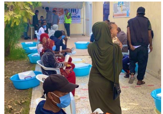
Recently released refugees and asylum-seekers receive assistance at the CDC, Tripoli.

Last week, UNHCR secured the release from detention of 141 refugee men, women and children. They were being held at Suq Alkhamees detention centre, 140 km east of Tripoli, some of them for over a year. At the Community Day Centre (CDC) and Serraj registration office, UNHCR, together with partners CESVI and International Rescue Committee (IRC), provided those released with core relief items (CRIs) and hygiene kits, medical check-ups, and WFP food packages.