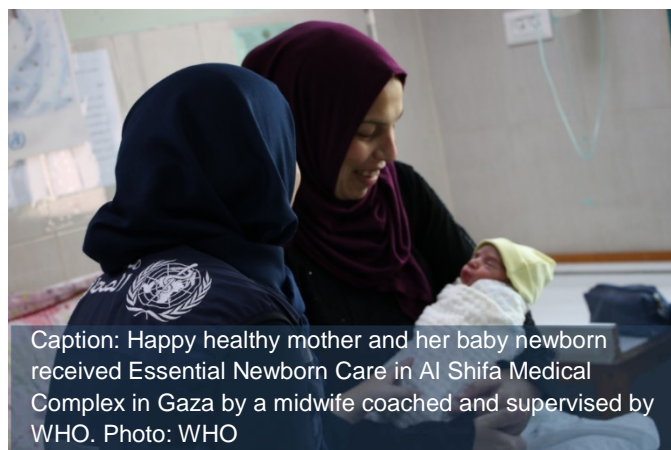
Caption: Happy healthy mother and her baby newborn received Essential Newborn Care in Al Shifa Medical Complex in Gaza by a midwife coached and supervised by WHO.