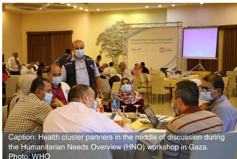
Caption: Health cluster partners in the middle of discussion during the Humanitarian Needs Overview (HNO) workshop in Gaza.