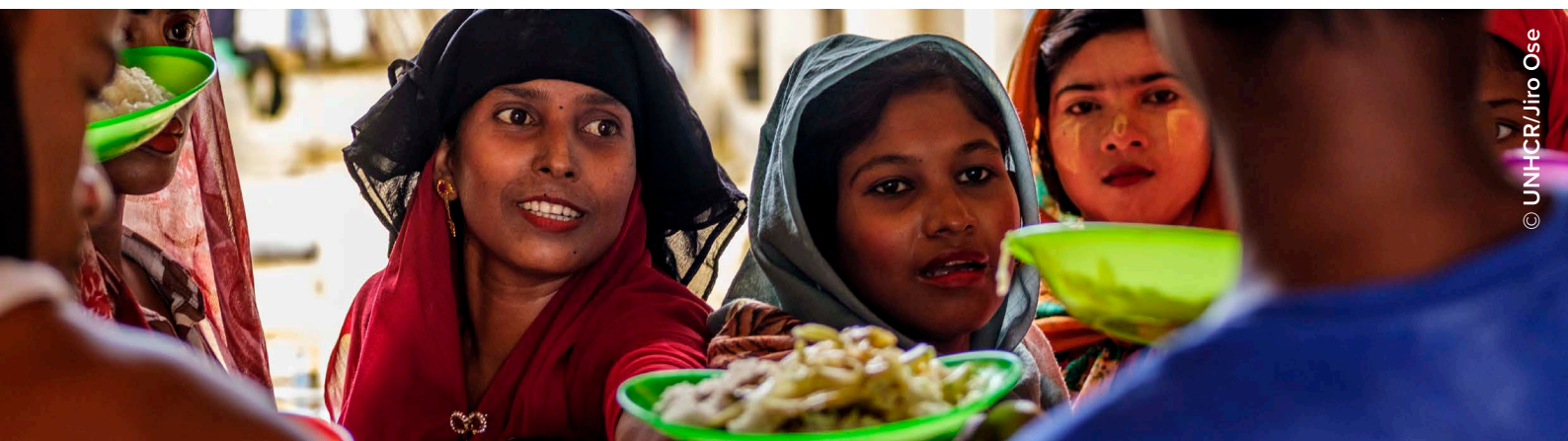
Rohingya refugees receive meals following their disembarkation in Lhokseumawe, Aceh, Indonesia, in September 2020.