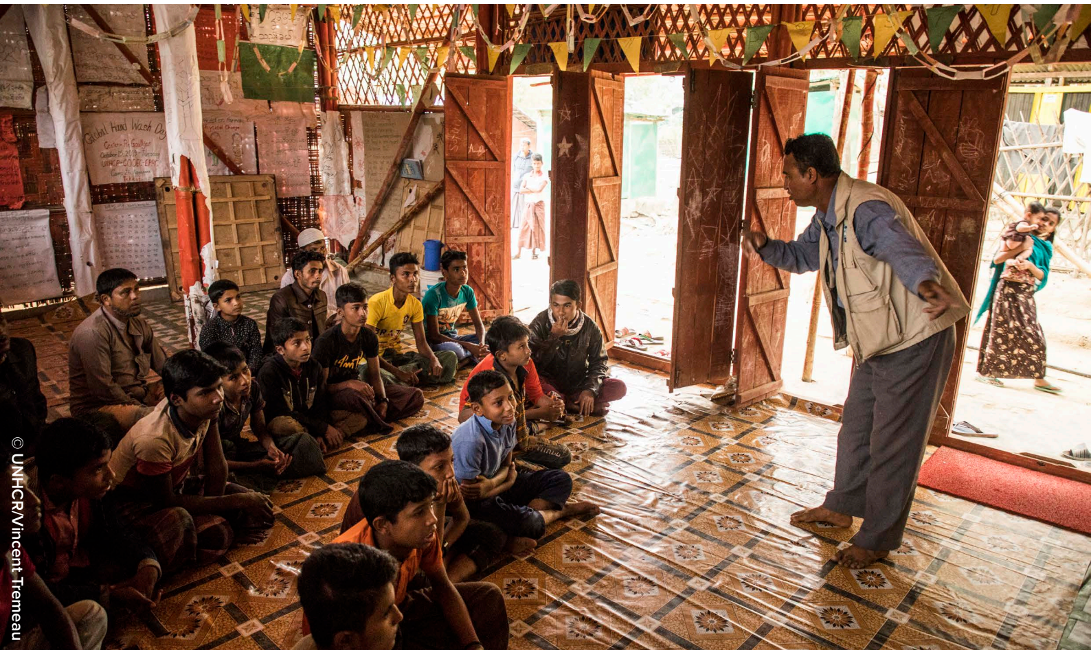
Rohingya boys listen during a class at an adolescent club in Nayapara refugee camp, Cox's Bazar, Bangladesh.

The Government and people of Bangladesh continue to shoulder the greatest burden for hosting Rohingya refugees, even as they seek to recover from nationwide flooding and contain the COVID-19 pandemic as well as mitigate its socioeconomic impact. The inclusion of Rohingya refugees in Bangladesh's COVID-19 response and a concerted prevention effort by the humanitarian community have thus far spared the refugee settlements in Cox's Bazar from the worst of the pandemic. Although COVID-19 restrictions have temporarily closed refugee learning centres, education actors have moved ahead with procuring learning materials and recruiting teachers for the Myanmar Curriculum Pilot approved by the Government of Bangladesh in January 2020.