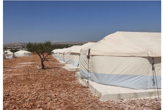
Gravelling of tents in Idleb.

(785 NFI kits in Idleb and 3,259 in Aleppo) and 9,407 tents (3,390 in Aleppo and 6,017 in Idleb). Moreover, by the end of August, UNHCR's partners did quick fixing to rehabilitate 2,000 houses for approximately 12,000 people. At the same time, UNHCR's protection partners conducted awareness raising and psychosocial support sessions, identified cases and referred them to basic services in Idleb and Aleppo Governorates; such community-based protection interventions reached 13,725 people . In addition, 3,762 displaced and vulnerable people received protection services such as awareness raising on civil status documentation and housing, land and properties, legal counselling and assistance, case management and referrals.