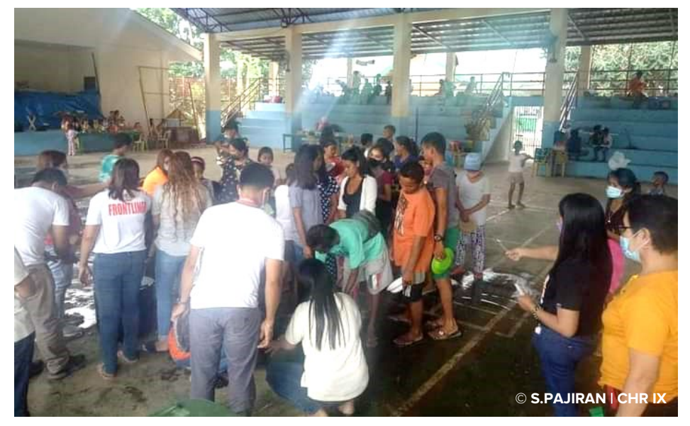
Some of the displaced families during the free lunch provided by an international organization in the covered court.