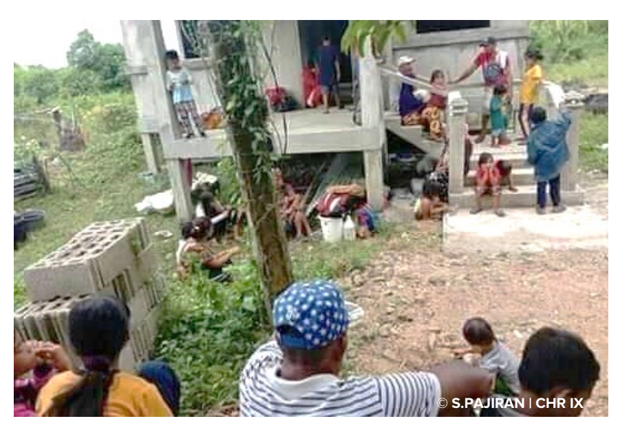
One of the temporary shelters occupied by the IDPs in the displacement location.