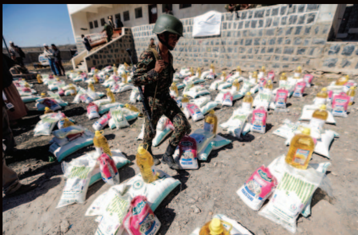
A Houthi-affiliated soldier walks among humanitarian aid supplies in a displaced persons camp on the outskirts of Yemen's capital, Sanaa, on March 16, 2017.

Human Rights Watch calls on Yemen's authorities to facilitate rapid aid to civilians in need and to introduce a transparent and accessible public information campaign about the nature and extent of Covid-19. It also calls on donors to fund aid agencies that provide critical assistance while upholding humanitarian principles of independence and impartiality. Finally, the United Nations should establish an independent inquiry into the extent of aid obstruction and shortcomings in the humanitarian community's response.