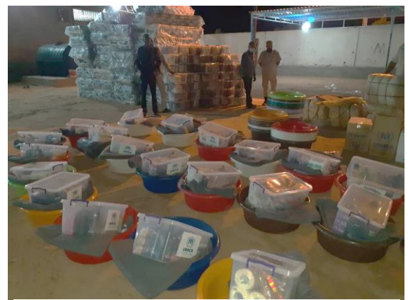
UNHCR's partner LibAid, providing CRIs at Al-Kufra detention centre in eastern Libya.

CRIs continue to be distributed in the urban setting and detention centres. Last week, partners CESVI, LibAid and Première Urgence Internationale distributed hygiene kits, mattresses, blankets, soap bars, wipes, solar lamps and hand sanitizers to 344 individuals in the urban community and 261 individuals being held in Al-Kufra, Al-Marj and Ganfooda detention centres in eastern Libya. So far this year, a total of 17,049 refugees and asylum-seekers received CRIs.