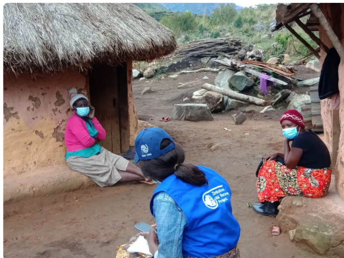
IOM staff conducts a shelter assessment in Chimanimani District.