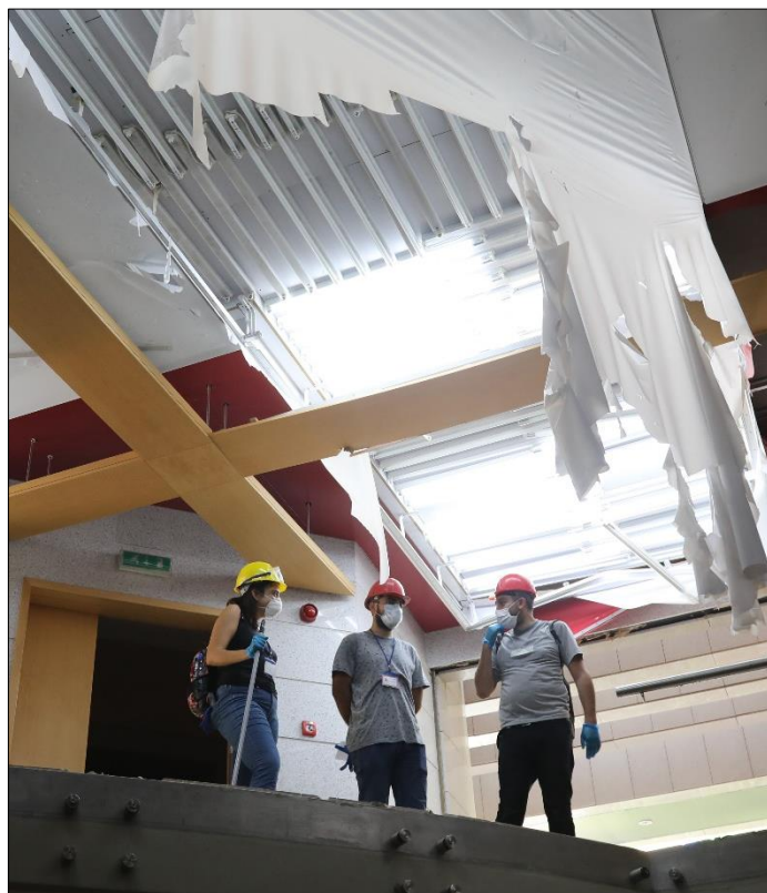
A damage assessment of Hôpital des Soeurs du Rosaire in Gemmayzeh.