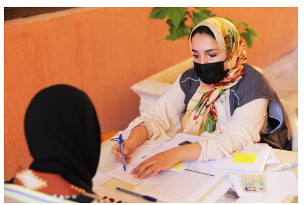
Provision of pre-paid cards for IDPs in Tripoli.

UNHCR continues to support internally displaced persons (IDPs) in Libva. On 27 Julv. UNHCR through its partner, Danish Refugee Council, started a round of cash assistance distribution for IDPs in Tripoli. This week, more than 300 displaced families were due to receive pre-paid cash cards that can be used to buy basic necessities. A total of 500 displaced families will be targeted in both Tripoli and Yefren (Nafusa