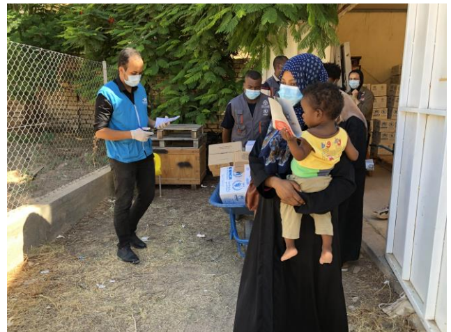
Distribution of food parcels at UNHCR's Serraj Registration Office.

On 22 July, UNHCR jointly with the World Food Programme (WFP) started the second round of food basket distributions at UNHCR's Serraj Registration Office. More than 100 refugees and asylum-seekers living in the urban community were provided with food parcels, designed to last for one month. The project overall aims to target up to 10,000 food-insecure individuals. The assistance is designed to help refugees and asylum-seekers severely affected by the socio-economic impacts of COVID-19 restrictions and conflict. The joint programme was launched in June, with 747 individuals receiving food parcels.