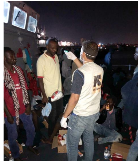
UNHCR and partner IRC providing assistance at a disembarkation point.

As of 16 July, 5,650 refugees and migrants have been registered as rescued/intercepted at sea by the Libyan Coast Guard and disembarked in Libya. The majority of those disembarked so far this year comprise nationals from Sudan, followed by Bangladesh and Mali. There is a 42 per cent increase in arrivals compared to the same period last year, where 3,982 persons disembarked between January and July 2019. So far this year, 1,670 persons of concern to UNHCR were brought back to Libyan ports. These include nationals from Sudan, Somalia, Eritrea, South Sudan, Ethiopia, and Palestine. UNHCR and its partner, the International Rescue Committee (IRC), continue to be present at disembarkation points to provide urgent medical assistance and core relief items (CRIs) before individuals are transferred to detention centres by the Libyan authorities.