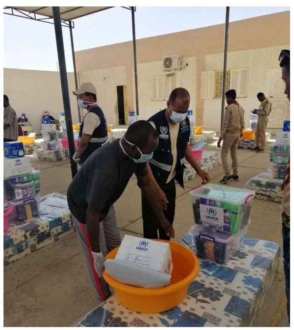
UNHCR with partner LibAID distributing NFIs for Murzuq IDPs in Taraghin Municipality