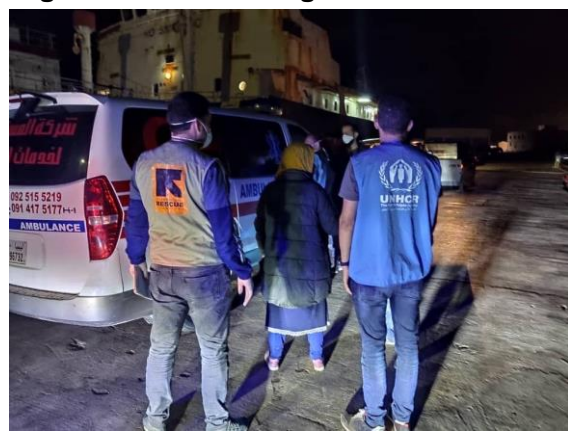
UNHCR and partner, IRC at the Tripoli Naval Base during a disembarkation operation.

intercepted at sea by the Libyan Coast Guard and disembarked in Libya in 2020. For the same period in 2019, the figure was 2,887. In addition, on 11 June, some 240 individuals disembarked at the Tripoli Naval Base. UNHCR and its partner, the International Rescue Committee (IRC), were present at the disembarkation point to provide urgent medical assistance and core relief items (CRIs) before individuals were transferred to detention centres by the Libyan authorities.