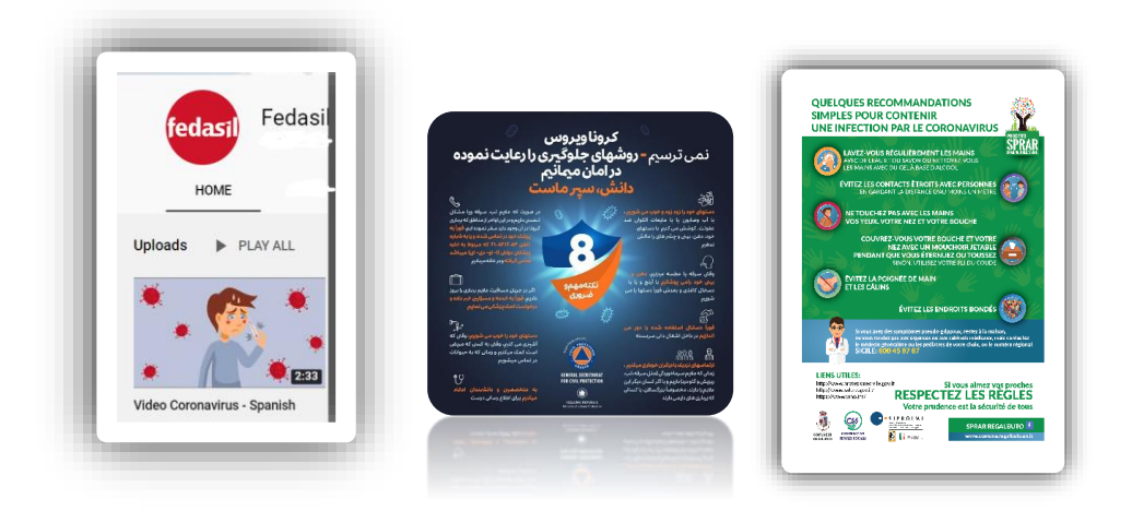
Examples of information material shared in Belgium, Greece and Italy.

Partner organisations, such as UNHCR and the IOM, also shared relevant information. On some occasions, UNHCR in cooperation with national authorities created dedicated multilingual portals and videos to provide information on the epidemiological emergency, such as in <u>Italy</u> and <u>Malta</u>.