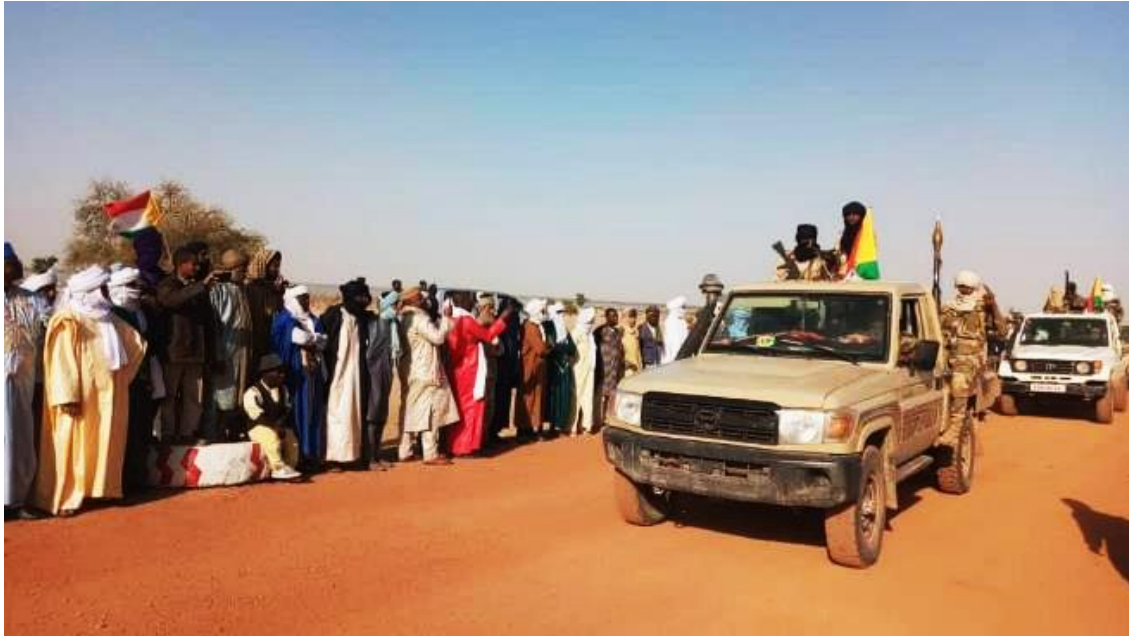
Military parade of vehicles at the CPA convention