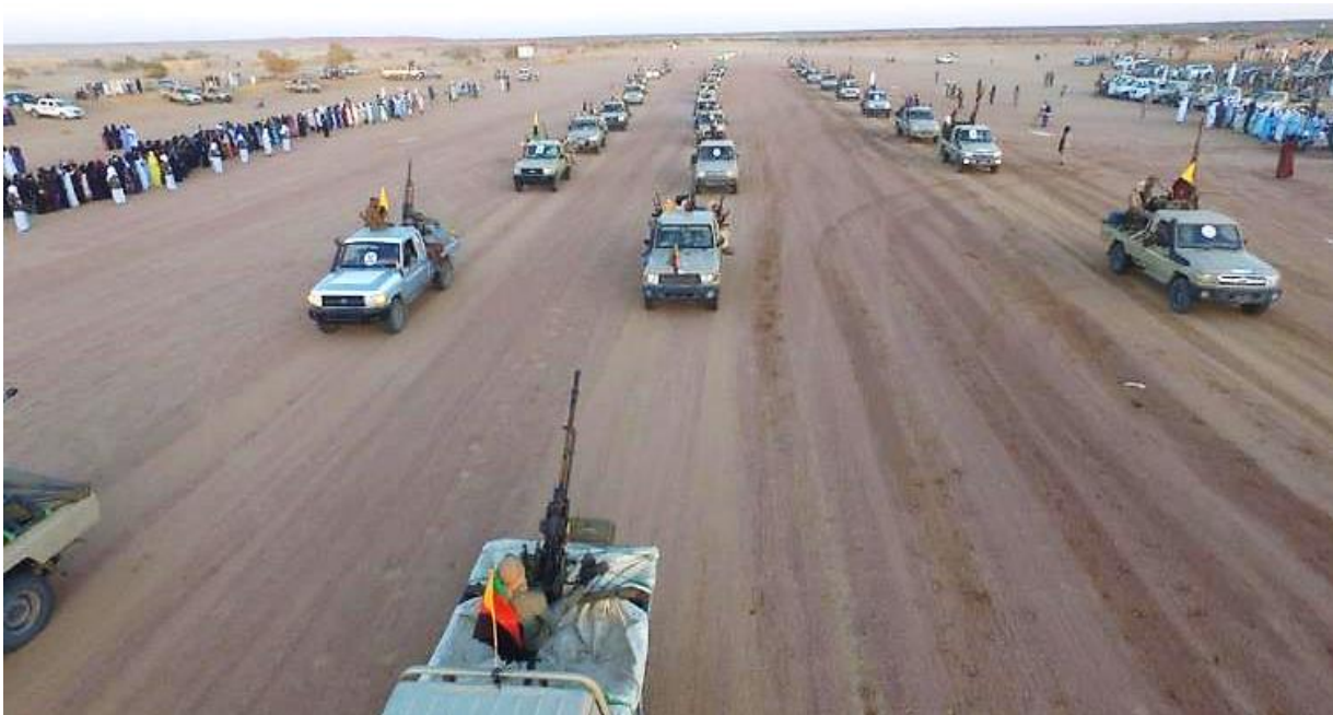
About 110 vehicles participated in the military parade of the MNLA

6. The military parade of the MNLA included more than 110 pick-up trucks and around 700 fighters, contradicting previous analysis of MNLA's military weakness compared to HCUA. A drone made an aerial footage of the parade and propaganda video clips were largely disseminated.