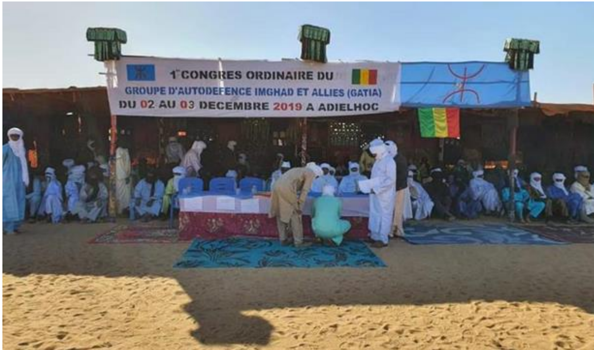
Photograph of the venue of the GATIA convention in Aguelhoc (Adjelhoc)