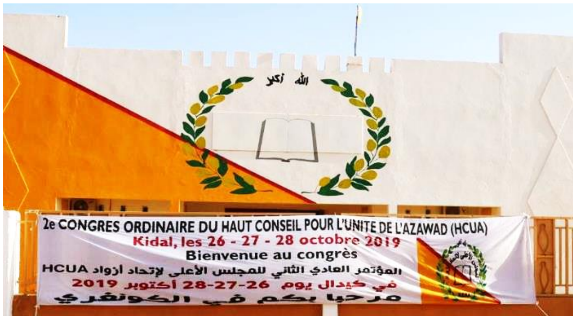
Welcome banner of the HCUA convention

3. The season opened with the second HCUA regular convention in Kidal, from 26 to 28 October 2019 – the first one having taken place in May 2014. Alghabass Ag Intalla was reappointed as secretary general of the HCUA in front of around 500 participants. The military parade included an approximate number of 90 vehicles and 600 fighters.