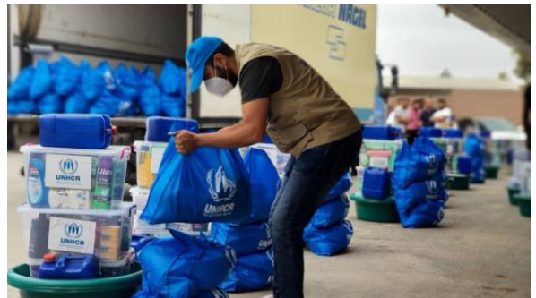
UNHCR's Ramadan distribution campaign.

During the month of Ramadan, UNHCR conducted a distribution campaign targeting refugees, asylum-seekers and internally displaced persons (IDPs) living in urban communities. Over the period and in total, more than 8,500 refugees, asylum-seekers and IDPs living in Tripoli, Misrata (190 km east of Tripoli) and Al-Zawiya (45 km west of Tripoli), received CRIs including food baskets, hygiene kits, water purification tablets and jerry cans.