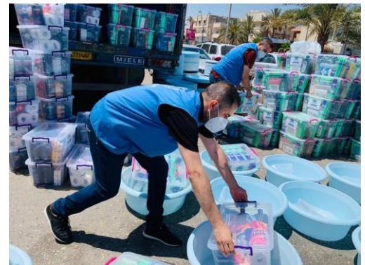
UNHCR's Ramadan distribution campaign in Tajoura district of Tripoli.

On 18 May, UNHCR through its partner LibAid distributed its Ramadan package to more than 500 IDP families living in the Hay Al-Andalus district of Tripoli. On 14 May, LibAid also distributed UNHCR soap to 235 families (1,130 individuals) at the Ajdabya Tawergha settlement, 160 km south of Benghazi. All main eastern IDP areas have now been covered by the distribution of around 12,000 bars of soap to more than 6,000 individuals in total. Through UNHCR's partner, the Danish Refugee Council (DRC), 140 displaced Libyan families were provided with pre-paid "cash cards" allowing them to purchase provisions at more than 2,000 point of sales centres in Tripoli.