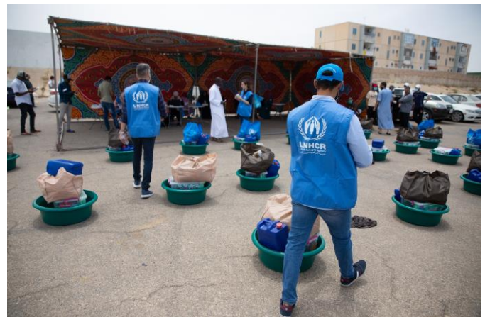
UNHCR distribution of CRIs to more than 600 refugees and asylum-seekers living in Janzour district in Tripoli.

Special thanks to major donors: Canada | Denmark | European Union | Finland | France | Germany | Italy | Japan | Norway | Sweden | Switzerland | The Netherlands | United Kingdom | USA | Private Donors