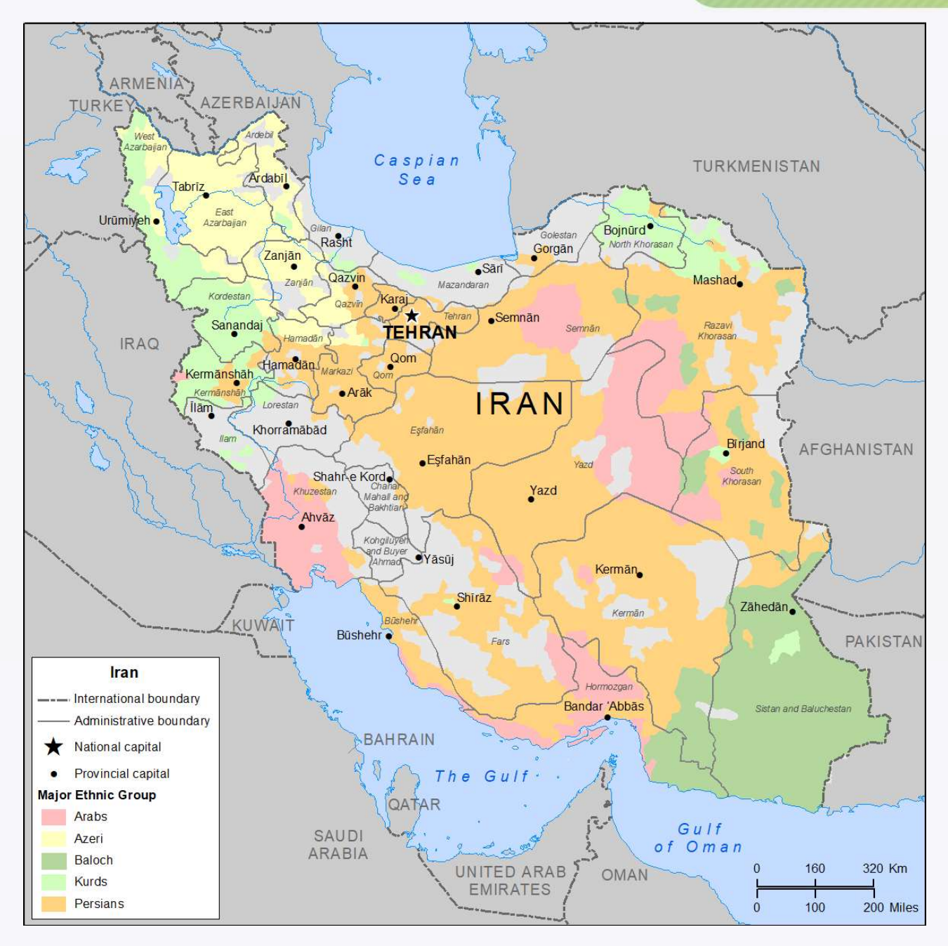
This map is presented for information only. The Department of Foreign Affairs and Trade accepts no responsibility for errors or omission of any geographic feature. Nomenclature and territorial boundaries may not necessarily reflect Australian government policy. Provided by the Commonwealth of Australia under Creative Commons Attribution 3.0 Australia licence.