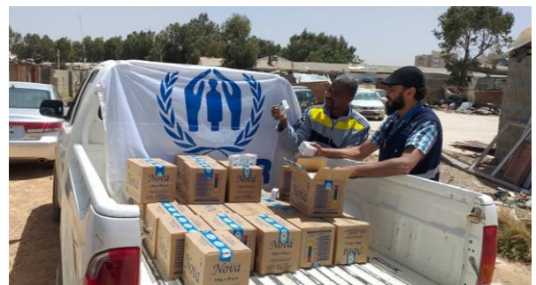
On 27 April, distribution of UNHCR of soap continues at the largest Tawerghan IDP settlements in Benghazi.

UNHCR's response to COVID-19 is ongoing. In particular, UNHCR's partner LibAid continues distribution in Benghazi settlements for the internally displaced (IDPs) of UNHCR bars of soap (two pieces per individual). On 26 April, the following locations were reached: Riyadiya 2 camp (412 individuals) and Shebna camp (168 individuals). On 27