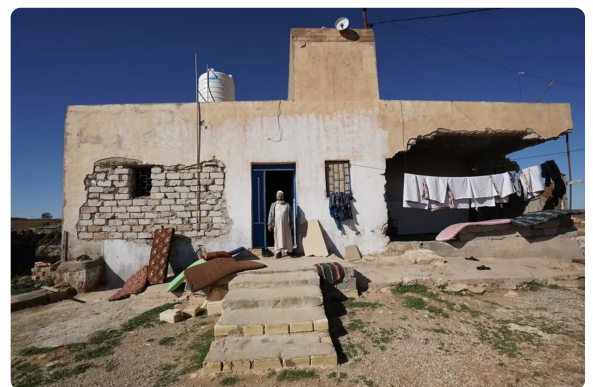
Ongoing conflict has damaged or destroyed people's homes, causing further displacement

While the conflict quickly became protracted and focused mostly in southern parts of Tripoli, from the end of 2019, fighting has increasingly moved into more populated areas, causing further civilian casualties and displacement. Between 1 April 2019 and 31 March 2020, UNSMIL documented at least 685 civilian casualties (356 deaths and 329 injured). Nearly 345,000 civilians remain in