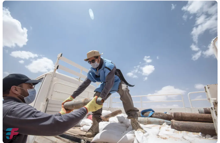
Explosive ordinance disposal teams working in Tawergha