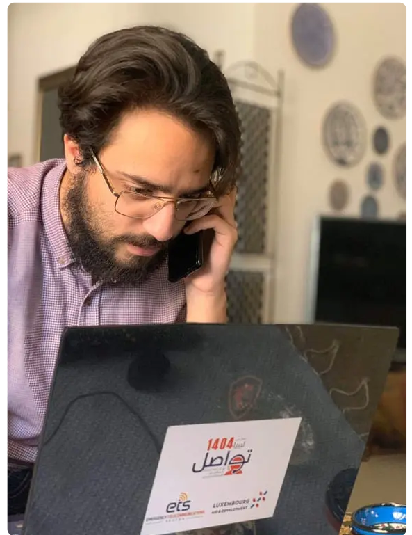
ETS-managed Common Feedback Mechanism call centre operator working from home during COVID-19

Other groups, such as people with disabilities struggle to continue to access the necessary health care and other support services. In a recent survey, 49 per cent of respondents reported having a person with a disability in the family. Health services for women were also expected to be more difficult, with 71 per cent of the female respondents expressing concerns regarding their access to healthcare, both due to the reliance on male family members to accompany them and a lack of capacity in health facilities to fight COVID-19 as well as continue to provide other essential services. This includes critical protection-related and psychosocial services.