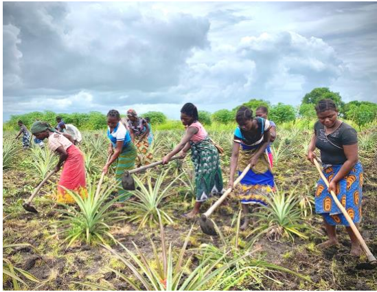
Photo: FFA activity in Mafambisse, Dondo District in 2020.

2.2 million cyclone and flood affected people assisted during the emergency response