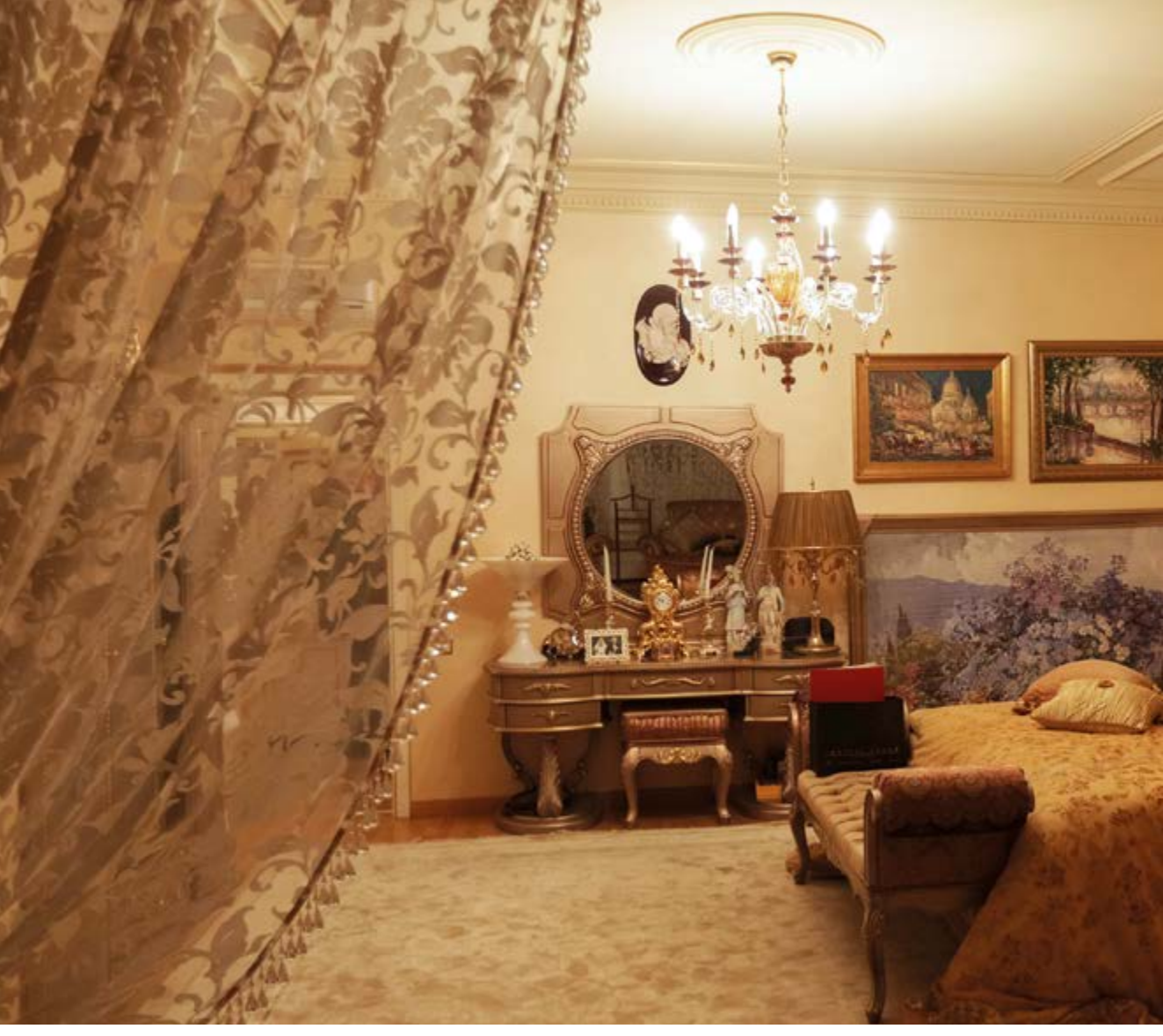
Living like royalty? The new anti-corruption offices are having a difficult time, especially in their investigations of high-ranking members of government and administration.

Head of the International Relations department at Transparency International Ukraine.<sup>11</sup> She emphasises that transparency can only be the first step, and that the implementation of reforms must follow.