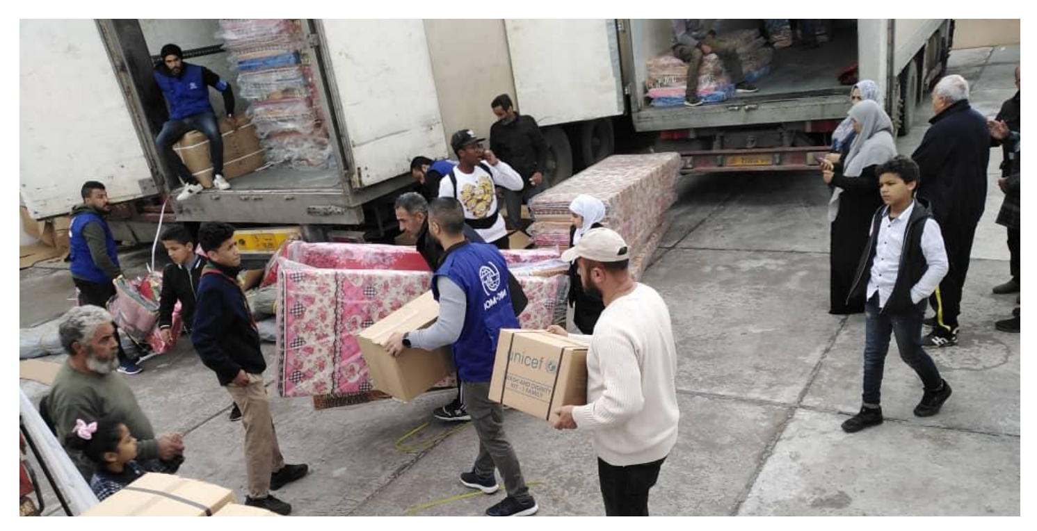
Internally displaced families from around Tripoli since April 2019 and from recent clashes received assistance in Central Tripoli, including food and essential non-food items.

Families from Sirt and Abu Qurayn areas have also fled fighting following clashes since January. Since mid-February 2020, an additional 372 families (1,860 individuals) have been internally displaced due to the volatile security situation in the area. This brings the total to at least 930 families (4,650 individuals) that are reported to have fled their homes to neighbouring areas.