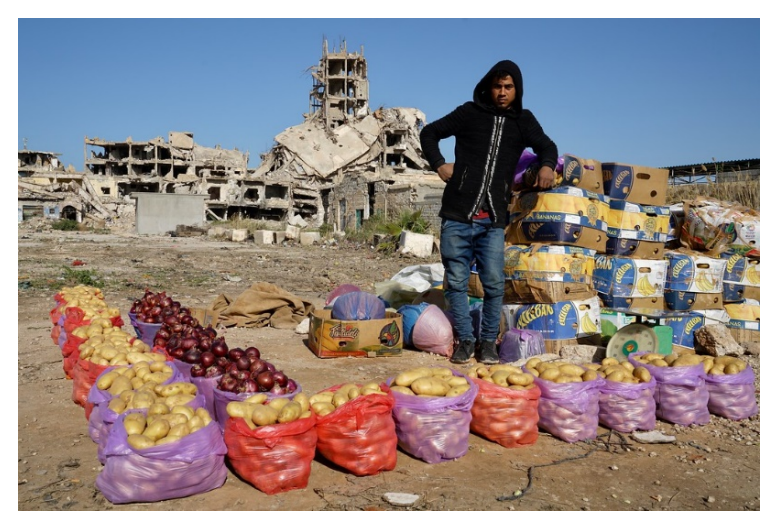
Vegetable market in the old town area in Benghazi