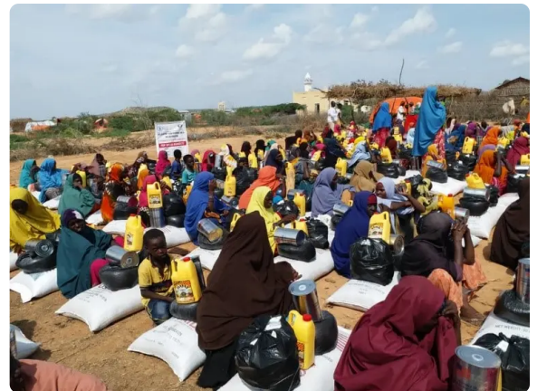
Humanitarian partners in Somalia face enormous challenges reaching people in need.

In 2020, restriction of movements for organizations, personnel or goods and violence have been reported. Three different directives addressed to humanitarian NGOs in Hirshabelle demanding registration of NGOs and projects were issued by three different state ministries. In January 2020, violence incidents against humanitarian staff were reported in Hirshabelle and Jubaland. On 17 February and 1 March, mortars landed in the UN premises in Mogadishu, interrupting work for UN staff and contractors for some hours.