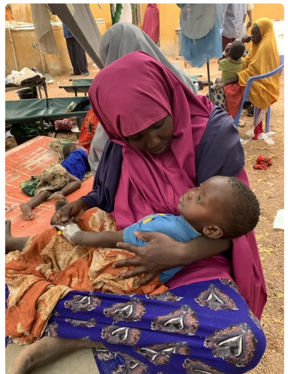
An AWD/cholera patient recovering after treatment at Belet Weyne regional hospital.

In addition, rapid response teams from the federal health ministry, local health authorities, WHO and partners remain vigilant; closely monitoring the situation, strengthening surveillance, verification and providing decentralized treatment. Health and WASH Cluster partners are working in close coordination on contact tracing, scale-up of community awareness on hygiene