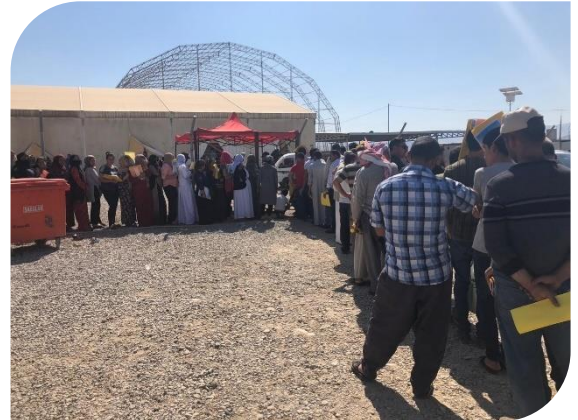
People queuing to apply for civil IDs in Dohuk

According to the Multi-Cluster Needs Assessment conducted from June to August 2019, 500,000 households reported missing at least one form of civil documentation, with female headed households particularly affected by missing documentation. Due to the lack of civil documentation, many IDPs and returnees are unable to access basic services such as education and health care, experience restrictions on their freedom of movement, are exposed to increased risk of arrest and detention, and may be excluded from recovery and reconstruction programmes. Furthermore, lack of civil documentation may increase the risk of statelessness for undocumented children. IDPs and returnees cite various challenges in obtaining civil documentation, such as the high transportation cost to access government offices in their places of origin, lengthy processing times, and difficulties in obtaining security clearance to travel and to obtain documentation.