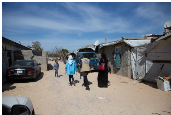
The Al-Fallah 1 IDP settlement in Tripoli.

On 2 March, UNHCR conducted an assessment visit to Al-Fallah 1 settlement for internally displaced persons (IDPs) in Tripoli. The aim of the visit was to hear first-hand some of the challenges facing around 1,200 IDPs living there since 2011. The site is located near areas of clashes in southern Tripoli. UNHCR will continue to follow up on the situation to provide humanitarian assistance. As of 6 March, UNHCR has distributed CRIs to 1,823 IDPs in Libya.