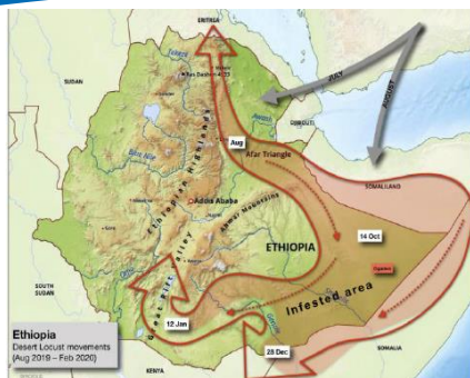
FAO Desert Locust Situation Update, Jan 2020

09 February 2020