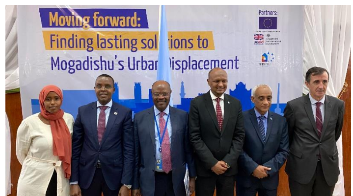
Somalia Government, UN and EU officials at the launch of Durable Solution Strategy in Mogadishu, Jan 2020.

The UN Integrated Office in Somalia supported the launch by the Banadir Administration of its Durable Solutions Strategy, a tool to address the next steps in solving the challenge of urban displacement in the region. The launch on 20 January was convened by the Mayor of Mogadishu/ Governor of Banadir and attended by a number of high-level national and international partners led by the Humanitarian Coordinator for Somalia, Mr. Adam Abdelmoula.