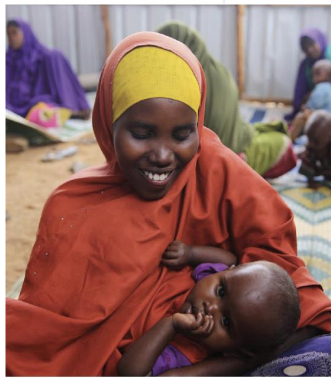
Somalia Humanitarian Response Plan, Jan 2020

HUMANITARIAN PROGRAMME CYCLE 2020 (2020 JANUARY - 2021 JANUARY)