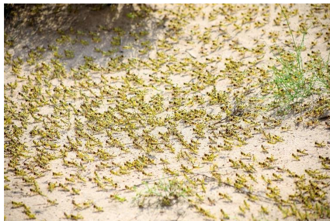
A swarm of Desert Locusts in Chidhi village, Salal region, Somaliland.

Desert locusts have spread to large parts of Somalia, prompting the Federal Government to declare a national emergency on 2 February. The infestation, the worst in 25 years, is a major threat to the country's already fragile food security situation. According to the Government, the scale at which the locusts are spreading is beyond the control capacity of the Government. In December, the first wave of locust swarms destroyed about 100,000 hectares (ha) of farmland and pastures in Somalia.