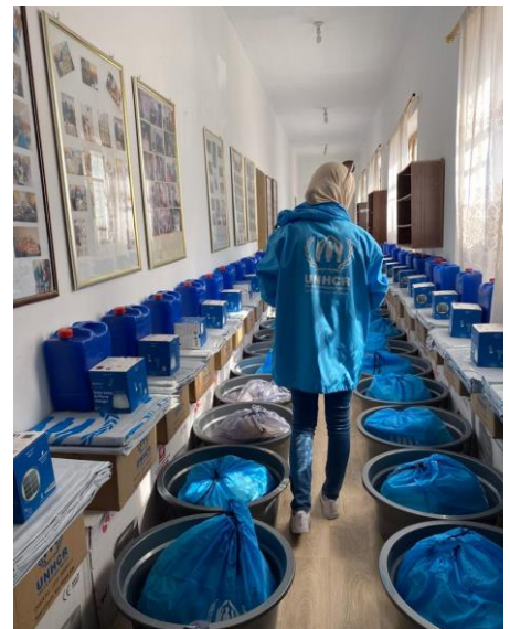
Distribution of CRIs to internally displaced families in Tripoli.

Special thanks to major donors: Canada | Denmark | European Union | Finland | France | Germany | Italy | Japan | Norway | Sweden | Switzerland | The Netherlands | United Kingdom | USA | Private Donors