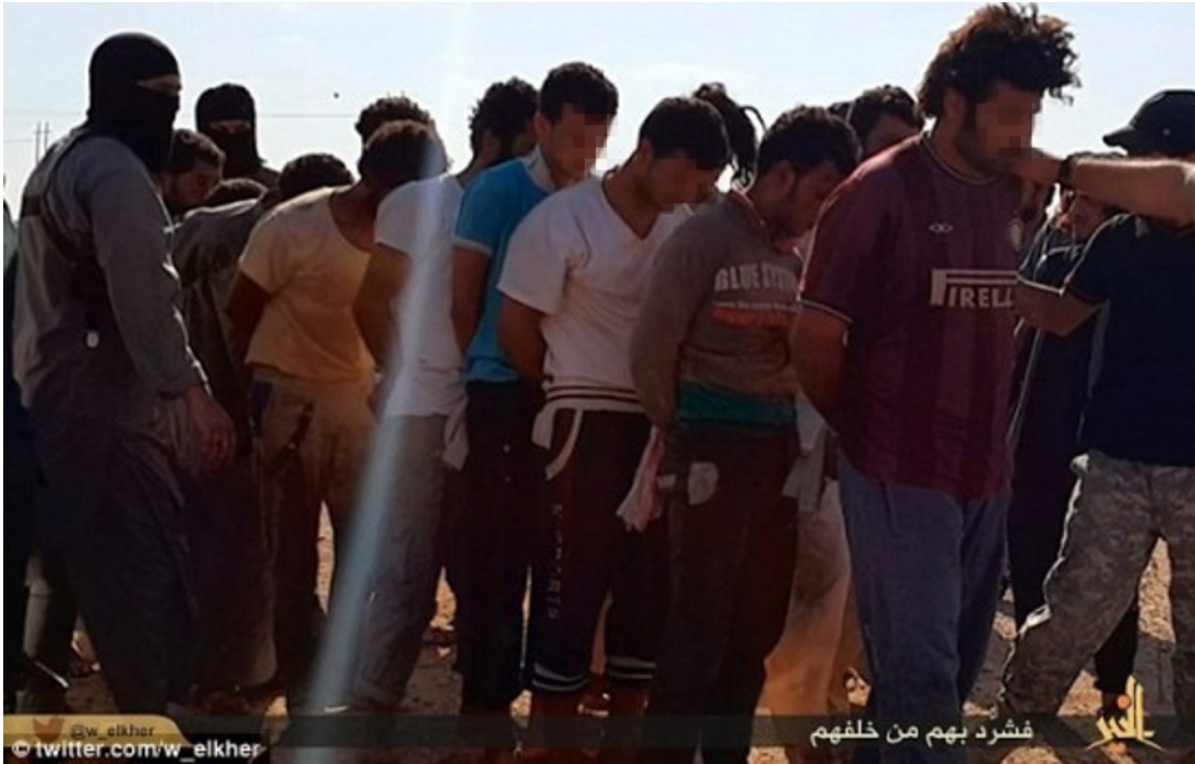
Screen capture of ISIS video, originally from Twitter, August 2014.

The fate of those detained remains unknown, though most reports indicate that they were executed.