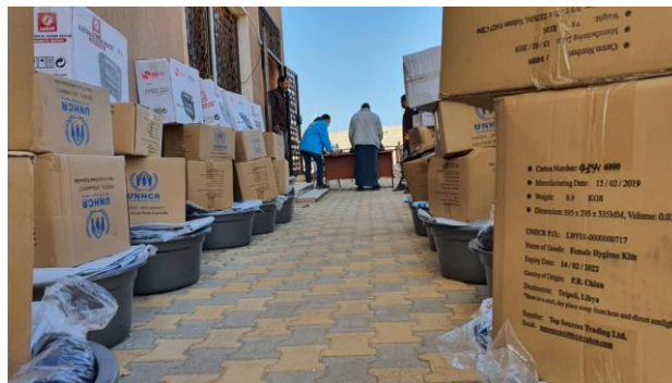
UNHCR distributes CRIs to IDP households in Az-Zawiya.

As of 518 IDP households in Az-Zawiya (50 km west of Tripoli). These families had been displaced from Tripoli following the outbreak of fighting in April 2019. On 6 February, UNHCR together with its partner, LibAid, brought CRIs to 460 IDP families in Misrata, recently displaced from Sirte. Two other UN agencies accompanied UNHCR: UNICEF distributed blankets and hygiene kits while UNFPA gave out dignity kits.