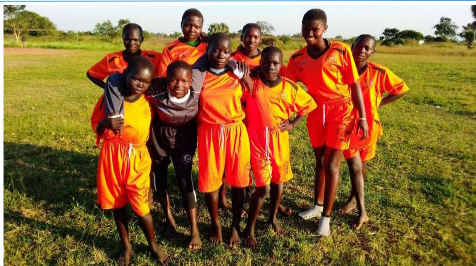
Girls in Arua settlement ready for a football match during the 16 Days of Activism