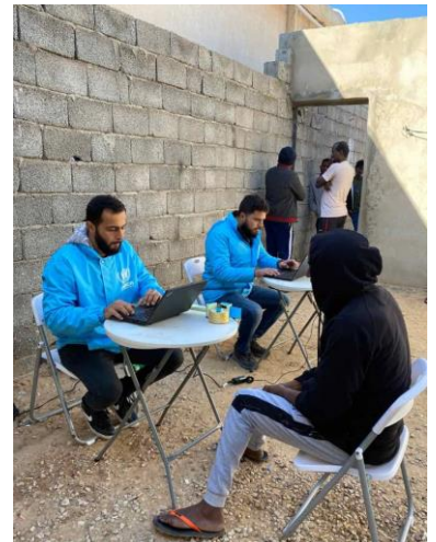
Registration of POCs at the Souq al-Khamis detention centre in Misrata.

Special thanks to major donors: Canada | Denmark | European Union | Finland | France | Germany | Italy | Japan | Norway | Sweden | Switzerland | The Netherlands | United Kingdom | USA | Private Donors