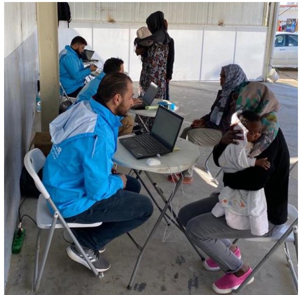
UNHCR conducting registration activities at Triq Al Sika detention centre in Tripoli.

On 15 January, a total of 19 refugees and asylum-seekers were released from Triq Al Sika detention centre, following UNHCR's advocacy. The group, comprising two men, 13 women and four children, were transferred to the CDC. They were provided with core-relief items (CRIs), cash grants and medical assistance.