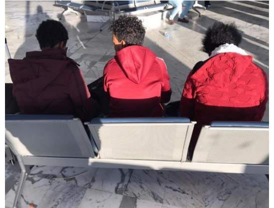
Three unaccompanied minors await their departure to Switzerland at Tunis Airport for family reunification.

UNHCR reiterates its call to the international community to provide more resettlement slots and humanitarian corridors to evacuate vulnerable refugees and asylum-seekers out of Libya.