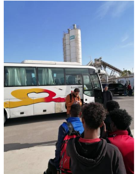
Individuals previously hosted at the GDF continue to transfer to the urban community. Currently the GDF hosts over 1,000 individuals.

Similarly, on 26 December, another group of 15 individuals (Eritrean and Somali, and including two females and one child) accepted the urban package. They were transferred to the CDC, where they received the usual CRIs and cash grants. The GDF still hosts over 1,000 people, the majority of whom are former detainees at the Tajoura and Abu Salim detention centres. These ex-detainees had sought assistance in July and October respectively due to clashes and the increasingly unstable security situation.