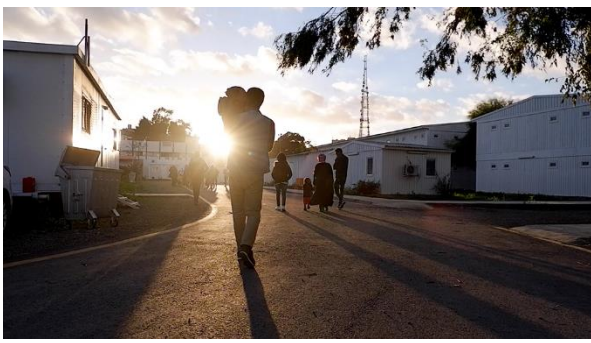
The GDF currently hosts over 1,000 individuals.

Individuals who spontaneously entered the GDF last July and October continue to move to the urban community. Between 15 and 17 December, 24 individuals (Sudanese, Eritreans, Somalis, and one Ethiopian) left the GDF, having agreed to accept an urban package of assistance. They received the assistance at UNHCR's Community Day Centre at Gurji, Tripoli, where they are provided with medical