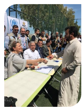
Distribution of civil IDs in Erbil

According to Multi-Cluster Needs Assessment conducted from June to August 2019, nearly 2.9 million individuals, including camp-based and outof-camp IDPs as well as returnees, are missing at least one form of civil documentation. Due to the lack of civil documentation, many IDPs and returnees are unable to access basic services such as education and health care, experience restrictions on their freedom of movement, are exposed to increased risk of arrest and detention, and may be excluded from recovery and reconstruction efforts. Moreover, without civil documentation, parents are unable to register the birth of their child. IDPs and returnees cite various challenges in obtaining civil documentation, such as the high transportation cost to access government offices in their places of origin, lengthy waits and processing times at the offices, and difficulties in obtaining security clearance to travel and to obtain documentation.