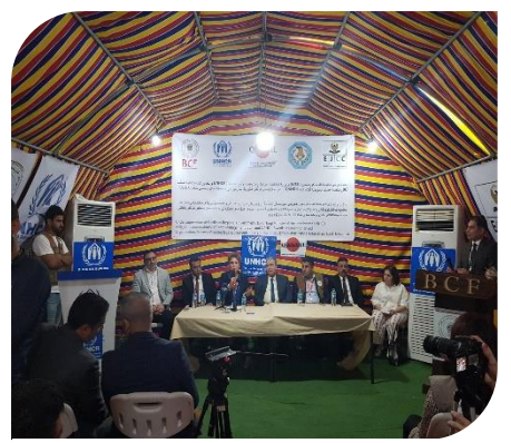
Opening ceremony of the project in Erbil @UNHCR.

IDPs from Ninewa Governorate. Given the successful implementation of the mission, the project was expanded to the remaining camps administered by EJCC (Hasansham U2, U3, Al-Khazir and Debaga). As a result, from April to October 2019, more than 4,200 CSIDs and 3,600 INCs were issued in these camps.