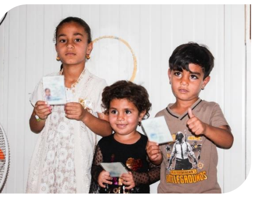
Children with their newly issued CSID cards

2019 in Baharka and Harsham camps in Erbil Governorate for