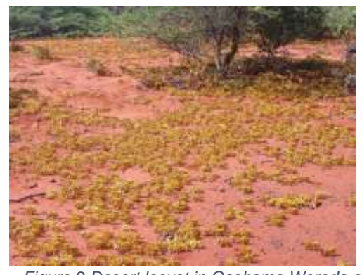
Figure 2 Desert locust in Gashamo Woreda of Somali region.

to the unfavorable rains in Amhara, Tigray, Oromia and Dire Dawa according to Mr. Belay