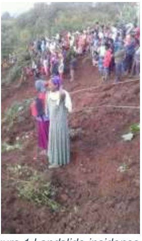
Figure 1 Landslide incidence in Konta district