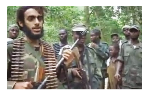
Screenshot of video released by ADF during Eid 2017 urging foreigners to travel to DRC and join them. The speaker is likely not Congolese and is more probably Tanzanian.

For ADF to be recognised as an official province of the Islamic State it would have to agree to a more distinct ideology and to have the Islamic State oversee its activities. This would require a greater investment of resources than the Islamic State currently has available, but it would gain a safe base in Africa, well protected from ground and air attack, and a launch pad for attacks across the continent. However, a major obstacle to any merger between the Islamic State and ADF, apart from their divergent objectives, is Sheikh Jamil and those ADF members who still support him. 141