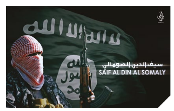
Screen shots from IS videos showing Somali fighters

By the end of 2017, al Shabaab had successfully silenced all pro-Islamic State voices within its foreign fighter group and had got its top foreign fighter ideologue, the Kenyan Ahmad Iman Ali, also known as Abu Zinira, who himself had been rumoured to be on the point of defecting to the Islamic State,<sup>22</sup> to issue a fatwa warning that anyone opposed to al Shabaab would be considered murtad (an apostate meriting death). By mid-2018, al Shabaab was even confident enough to free from imprisonment all foreign fighters who had been suspected of Islamic State membership or sympathy, allowing them to stay with their families in al Shabaab controlled areas, but without regaining any position of responsibility in al Shabaab or having an obligation to fight.<sup>23</sup> This appears to have been a pragmatic move designed to quiet the disaffection among foreign members of the group and free up space in the prisons, while avoiding any risk that the ex-prisoners would seek revenge from within the ranks.