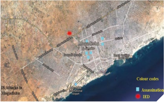
ISS (Mogadishu) attacks in and around Mogadishu, the Hiraal Institute – July 2018

As of July 2018, ISS had begun to establish strongholds in Bakaara in Mogadishu and in Elasha Biyaha, just outside the capital on the road to Afgoye.90 Al Shabaab leaders were concerned that they had lost the operational initiative to ISS in Mogadishu.91 For example, al Shabaab organised an attack in the city but was surprised to find a video recording the operation posted on the Internet by the Islamic State-affiliated Amag news agency: al Shabaab discovered that the amniyat members it had sent to conduct the operation had defected to ISS. Other al Shabaab amniyat officials assigned to Mogadishu have done the same, so making it easier for ordinary al Shabaab members to leave without discovery.