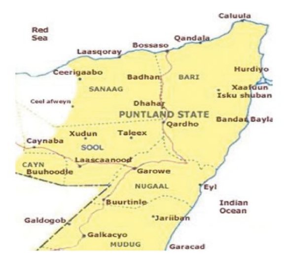
Map of Puntland and parts of Somaliland