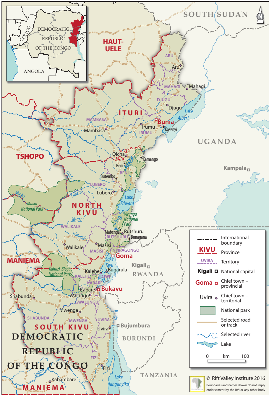
Map. The eastern Congo