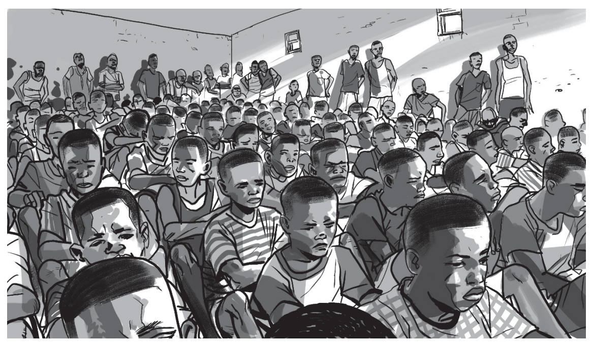
Children said they had no activities and that severe overcrowding limited their movement.