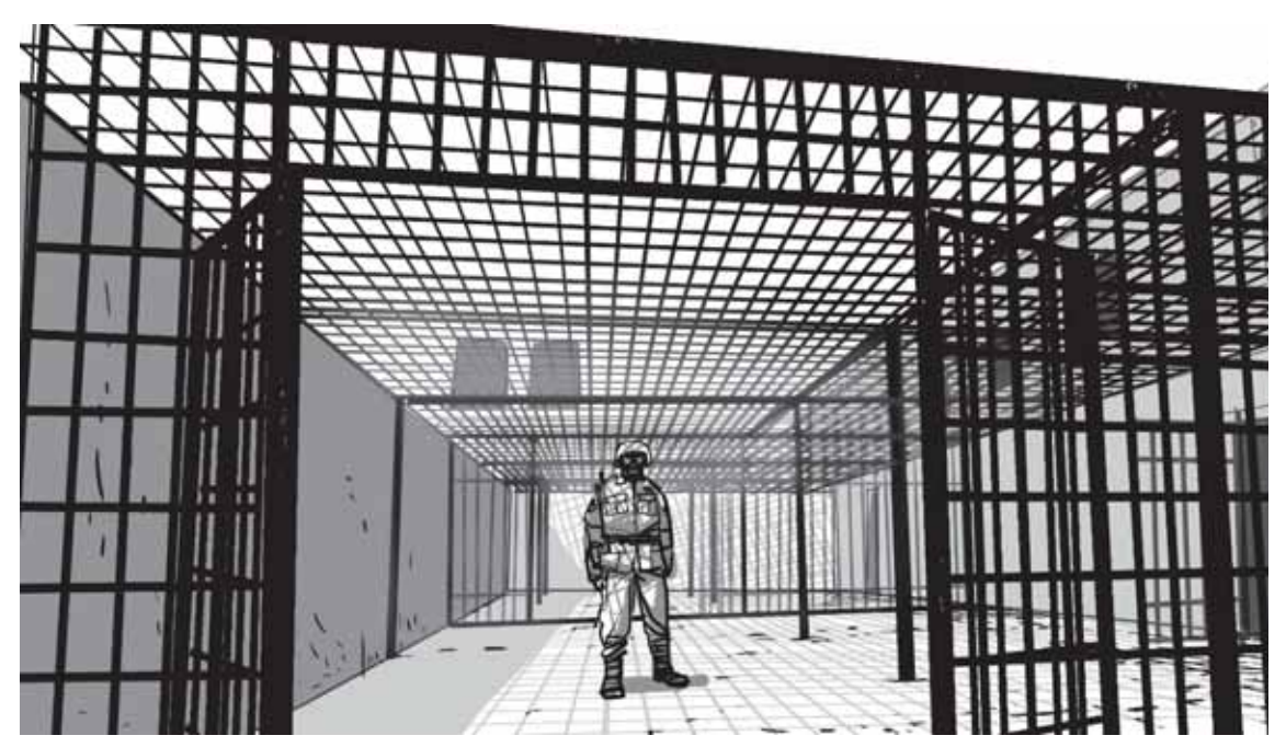
A barred enclosure, known as "the cage", adjacent to prison cells at Giwa military barracks in Maiduguri.

In April 2018, Nigerian media reported that in response to criticism regarding conditions at Giwa barracks, Nigerian Army engineers had constructed a new detention facility at Giwa with capacity for 200.68 Human Rights Watch has no information on whether children have been detained in the new facility.