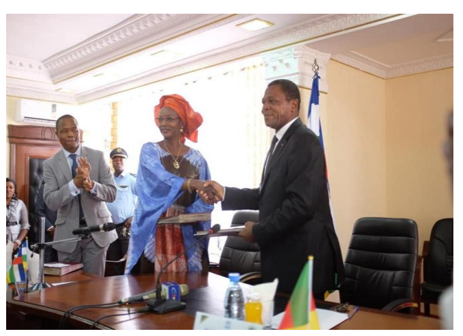
Handshake of the Cameroonian Minister for Territorial Administration and the CAR Minister for Humanitarian Action.