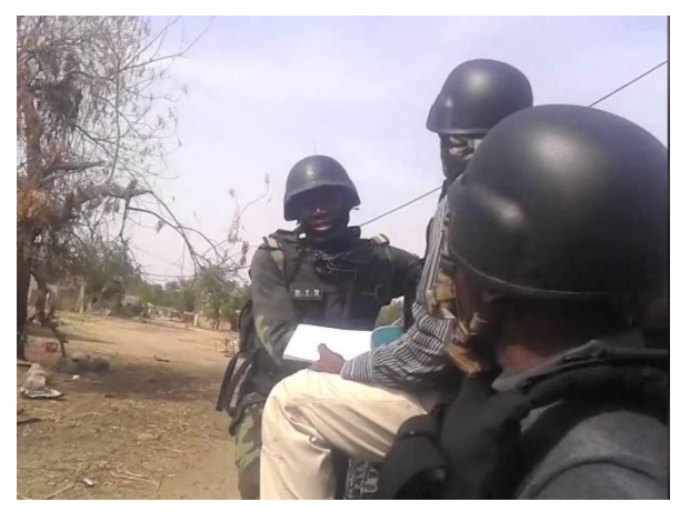
Une vue partielle des acteurs militaire sur le terrain dans l'extrême nord

Du 24 au 31 juillet 2019, OCHA a organisé deux séries de formations sur la Coordination Civilo-militaire (CMCoord) respectivement à Maroua et à Kousseri dans la région de l'Extrême Nord. Au-delà des concepts propres à la CMCoord, ces formations proposaient également de modules détaillés sur le Droit International Humanitaire, la protection des civils dans les conflits, la protection de l'enfance, les violences basées sur le genre, le droit au logement et à la terre, le caractère civil et humanitaire de l'asile ou encore l'accès humanitaire.