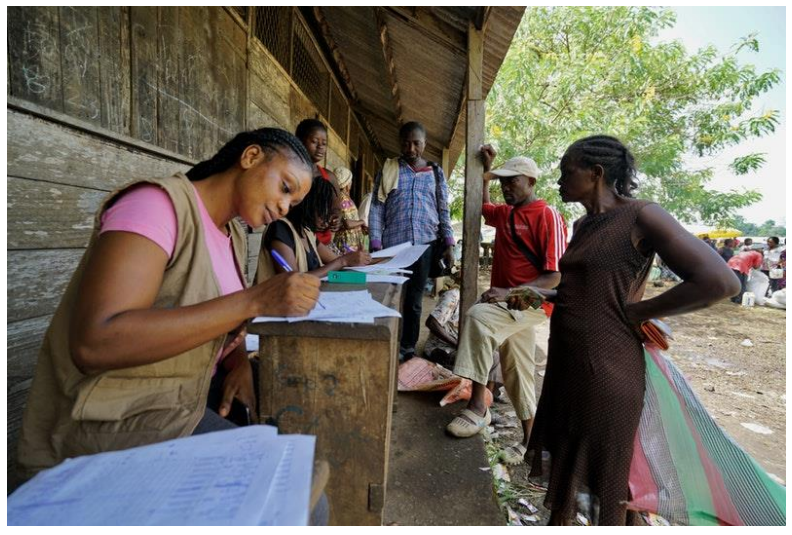
Humanitarian aid workers identifying persons in need

with Sky News, the Under-Secretary-General for Humanitarian Affairs and Emergency Relief Coordinator reiterated his call on all parties to respect international human rights and international humanitarian law. He called on them to facilitate safe, timely, and unhindered access for humanitarian organizations to deliver life-saving aid to the most vulnerable. OCHA has continued to advocate for an end to harassments of humanitarians. It chairs the Communication and Access Working Groups (WG). These WGs seek solutions to humanitarian access and acceptance.