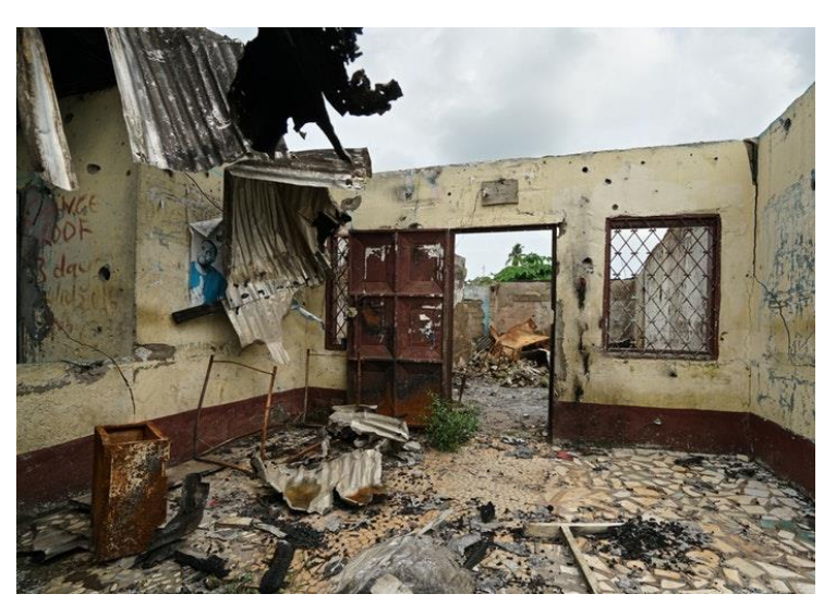
Attacks and destruction of property have increased displacements

The Protection situation in the NWSW regions continues to deteriorate with continued reports of restriction on movements through State-run checkpoints and harassment and abuse of civilians. Freedom of movement has further been complicated by difficulties in obtaining civil status documents following a Government decree to process civil status documents only on Mondays, a "ghost town" day in the regions. There are continued reports of arbitrary arrests by the State security forces with victims mostly young men who are suspected to be members of non-State armed groups. Moreover, there are reports of extra-judicial killings perpetrated by both parties to the conflict. Victims include women, children and older persons. The education boycott remains effective especially in areas outside the main cities. Non-State armed groups (NSAGs) have continued attacking and abusing individuals they suspect to be Government