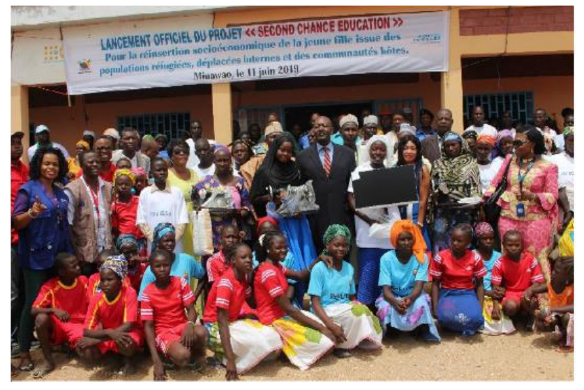
Beneficiaries take group photograph after the launching of the SCE project

300 young girls and women aged between 15 and 25 years, either school dropouts or who have never been to school, are to be trained on Information and Communication Technologies (ICTs), tailoring, agriculture, livestock rearing and