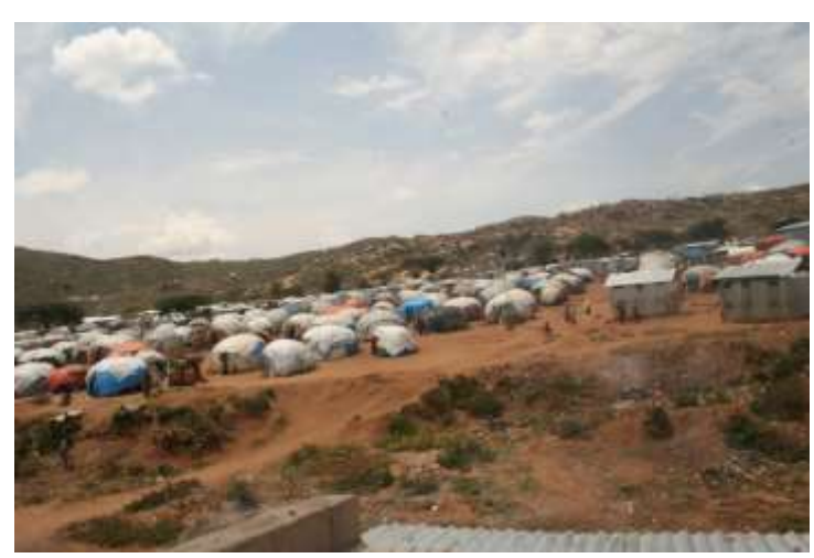
Figure 1 Qoloji IDP settlement site.

An assessment carried out by a regional DPPB team in Qoloji camp classified IDPs according to the areas of their ancestors. The team