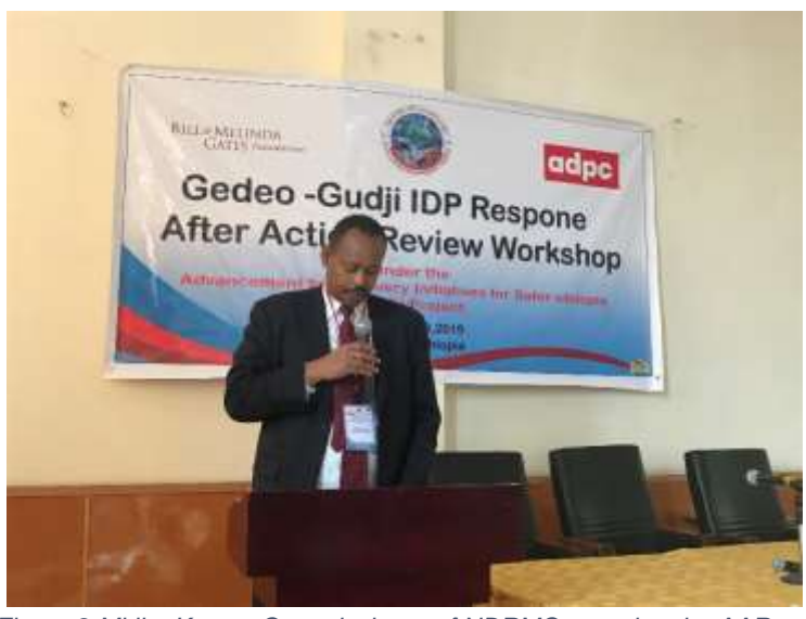
Figure 2 Mitiku Kassa, Commissioner of NDRMC, opening the AAR workshop in Adama, Ethiopia.

The workshop is part of the Advancement for Recovery Initiatives for Safer Ethiopia (ARISE), which NDRMC implements in partnership with the Asian Disaster