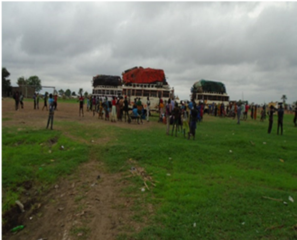
Buses from Sudan carrying South Sudanese refugee returnees arrives in Rubkona County in Unity State of South Sudan. June2019.