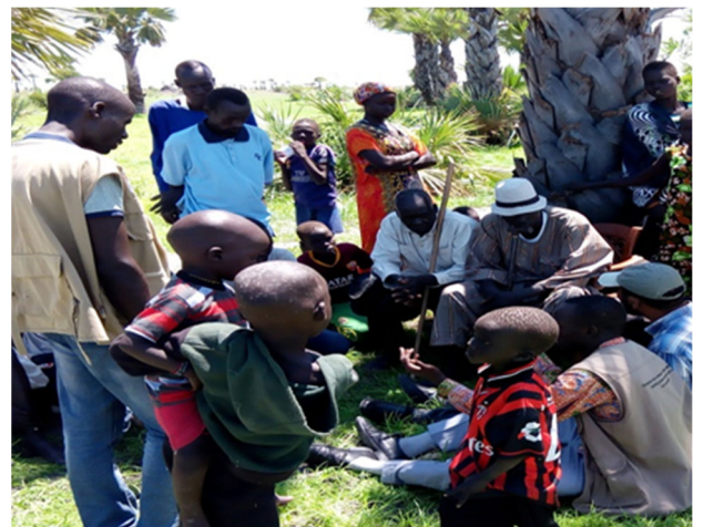
UNHCR and partners conducting focus group discussion with South Sudanese refugee returnees from Sudan in Mayendit County.