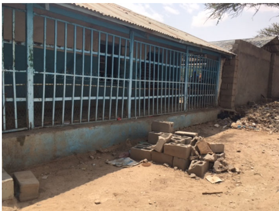
Fig. 1 Entrance to Mental Health Department, Hargeisa Group Hospital, Hargeisa, Somaliland.