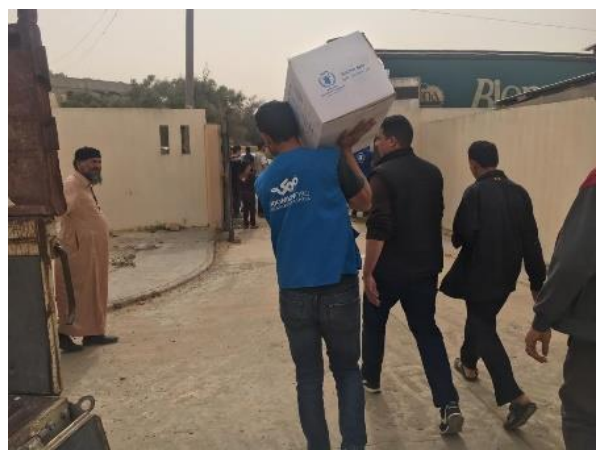
Food parcel distribution to IDPs, Msallata

assistance to more than 270 individual IDPs in Azzawiyah.