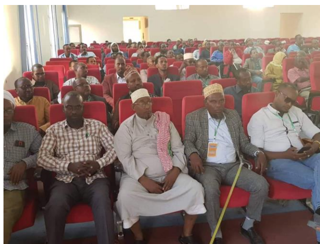
Figure 2 Fund raising event for Somali IDP response.

On 14 May 2019, the Somali Region President's Office and the Somali Region Disaster Prevention and Preparedness Bureau, in collaboration with the regional Chamber of Commerce and social media activists, organized a public fundraising event with a theme: 'Feed your brothers and sisters who need most your support.' to address the needs of the displaced and returning IDPs in the region. The event mobilized nearly US$1 million from various private companies and individuals. The purpose of the fundraising was to support more than 1.1 million IDPs in the region with basic needs such as food, water, health as well as long term solutions including the relocation of IDPs.