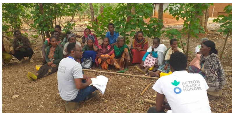
Figure 1 Emergency needs assessment in Kamashi zone (22-25 May, 2019).

The INGO Action Against Hunger reported that it has now gained full access in Kamashi zone of Benishangul Gumuz region. On 22-25 May 2019, the INGO deployed a Multi-Disciplinary Rapid Assessment team to conduct an emergency needs assessment in districts bordering West Wollega zone of