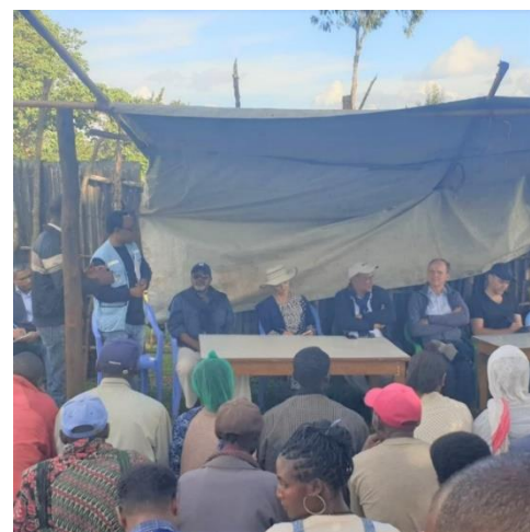
Figure 3 Government, donor, partners mission to Gedeo/West Guji.

Upon the invitation of the Ministry of Peace (MoP), a high-level Government and donor joint mission went to Gedeo/West Guji zones where Government return operations are being implemented at full scale. The MoP has been actively working to engage partners in all phases of IDP response efforts, including by requesting partners to report on breaches of humanitarian principles during the return. The mission observed gaps including protection concerns in the return process and the lack of assistance in areas of return. The Ethiopian Humanitarian Country Team (EHCT) tasked the Protection Cluster to lead a process of identifying viable interventions for partners in areas of return in line with the “do no harm” principles and with a focus on accountability to the affected population. During the mission, partners advocated with zonal authorities for better security in areas of return; full access to IDPs in sites and in return areas; as well as for better coordination between zonal authorities and partners on the ground.